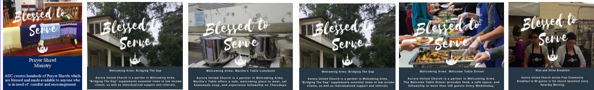
Prayer Shawl Welcome Arms Martha's Table Bridging The Gap Welcome Table Rise & Shine Breakfast